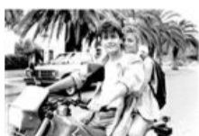
Photo Gallery: The many faces of Charlie Sheen