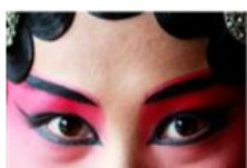
Gallery: International Women's Day celebrations around the world