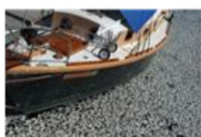
Millions of dead anchovies wash up near L.A.