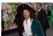
Gallery: Stars mingle at Mardi Gras parades