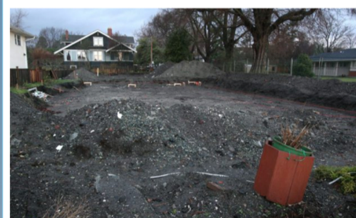
Excavation of this property in 2007 wound up requiring an archeological impact assessment permit.

An Oak Bay woman who built a house on an unregistered aboriginal midden has had her bid to recoup $600,000 from the provincial Archeology Branch struck down.