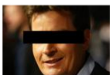
How to make Charlie Sheen go away